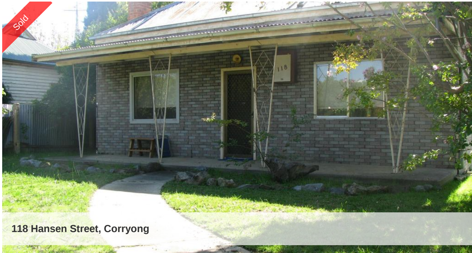
118 Hansen Street, Corryong