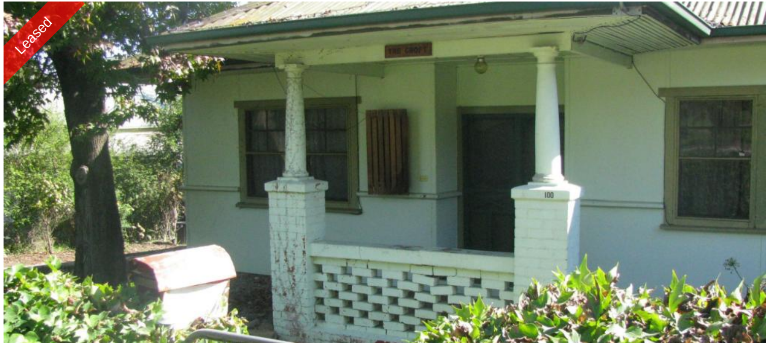
100 Hanson Street St, Corryong