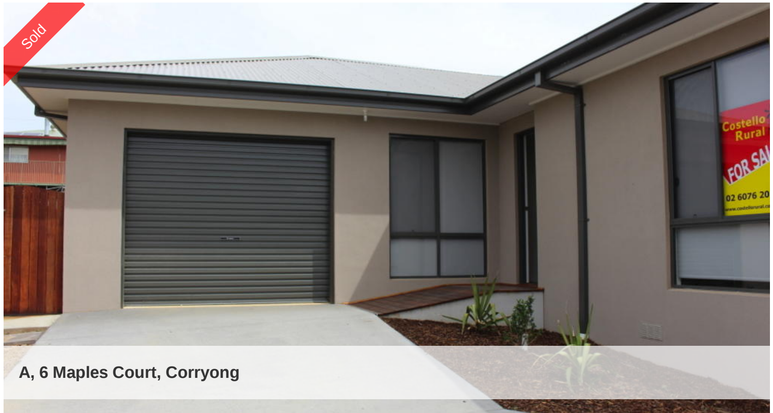
A, 6 Maples Court, Corryong