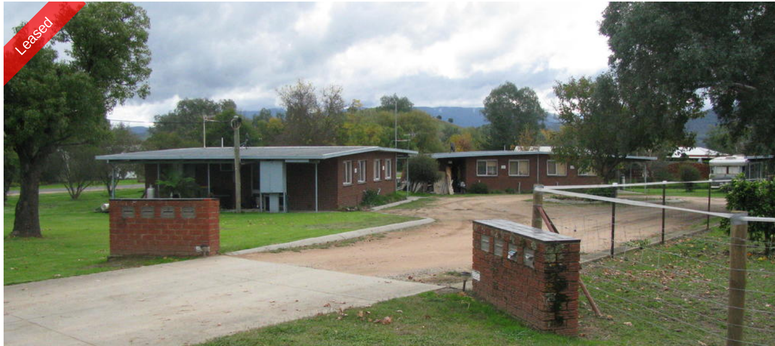
Unit 6, 214 Hanson St, Corryong